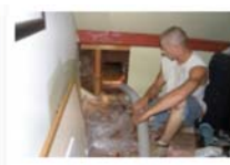
Energy & Utilities