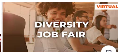
Lowell Job Fair - Lowell Career Fair Mon, Oct 3, 11:00 AM