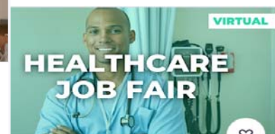
Lowell Job Fair - Lowell Career Fair Thu, Oct 27, 11:00 AM