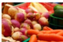
Food & Nutrition