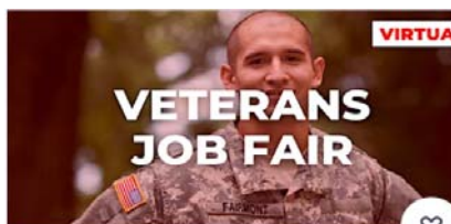
Lowell Job Fair - Lowell Career Fair Fri, Oct 14, 11:00 AM