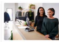
Entrepreneurship Center/Business Assistance