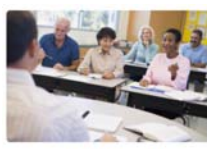
Employment & Training